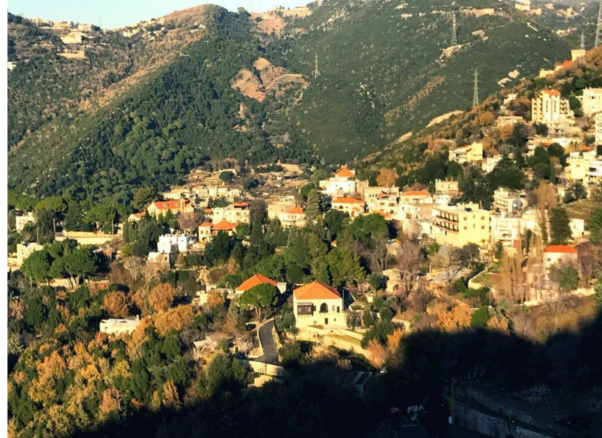
Aramoun Village Mount Lebanon

Polio Public Health Poster in Arabic “The mother who protects her child protects (defends) her country”