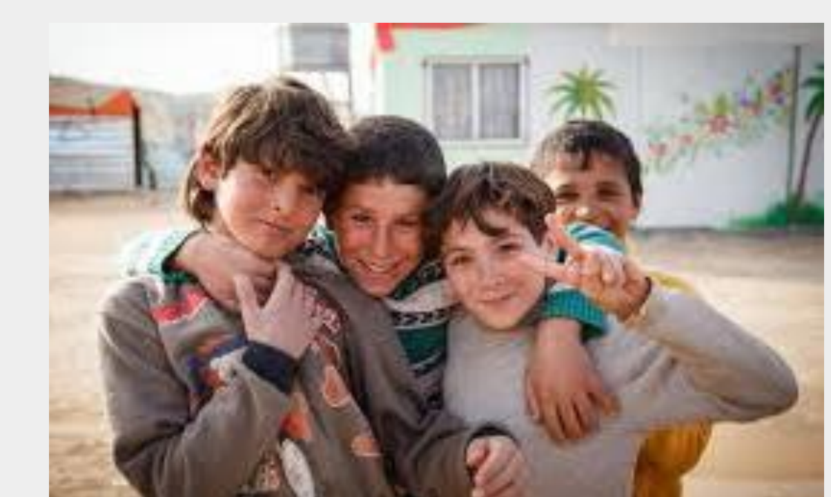
Concierge and boys

Student Conclusion: “Lessons learned were superior to anything we could have read in textbooks”