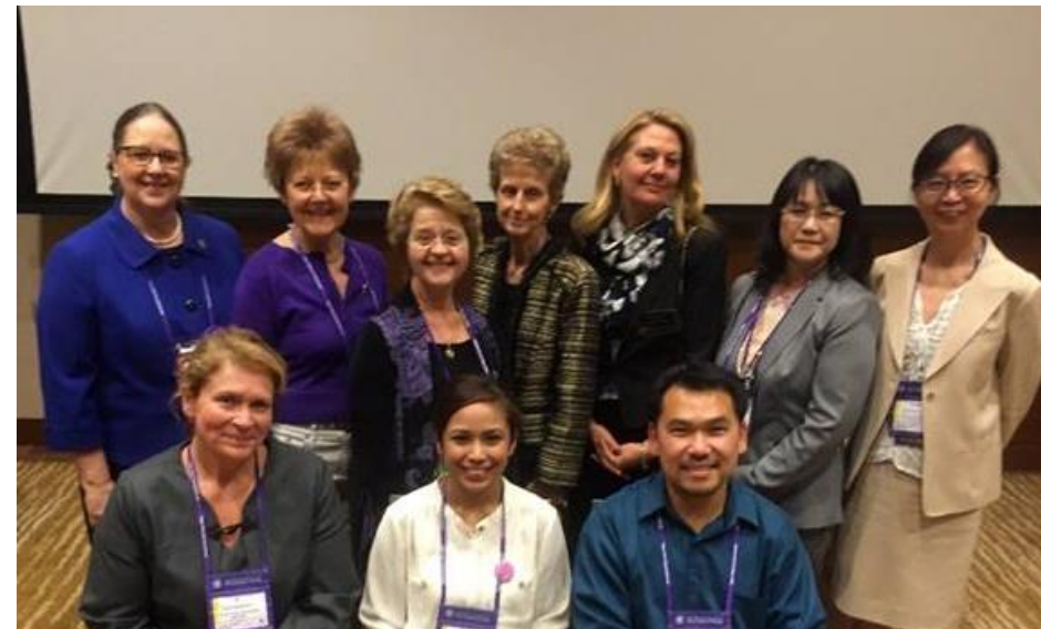
STTI Biennial 2015 GLMC