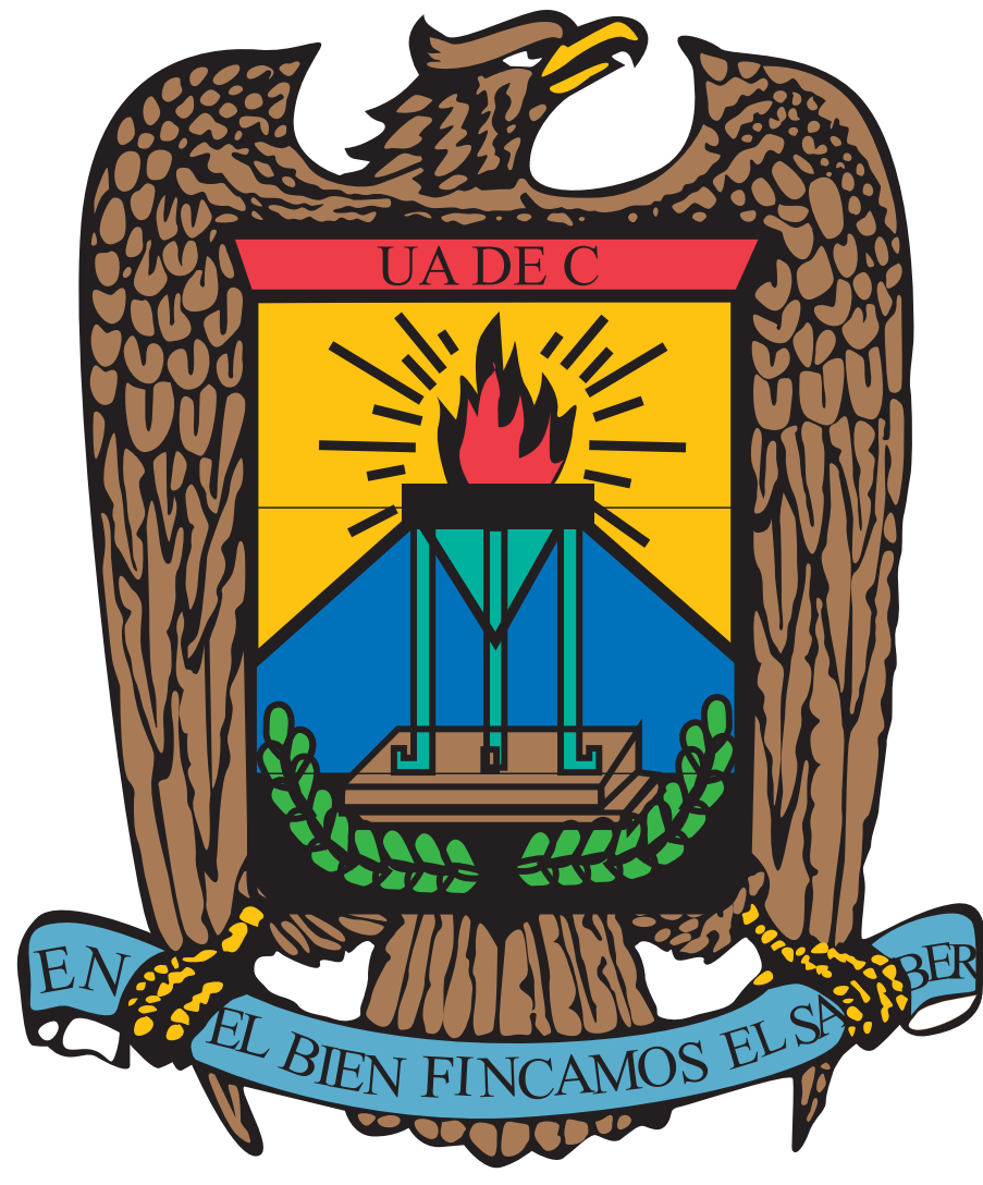
Universidad Autónoma de Coahuila