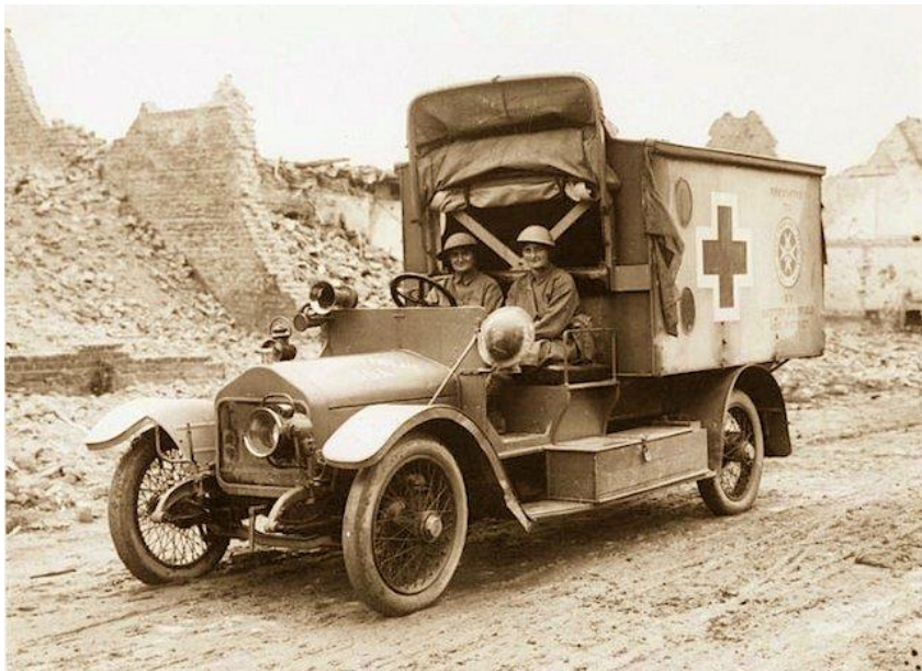
Elsie Knocker and Mairi Chisholm in their Wolseley Ambulance, Pervyse...

Elsie Knocker 1884-1978 (and Mairi Chisholm)