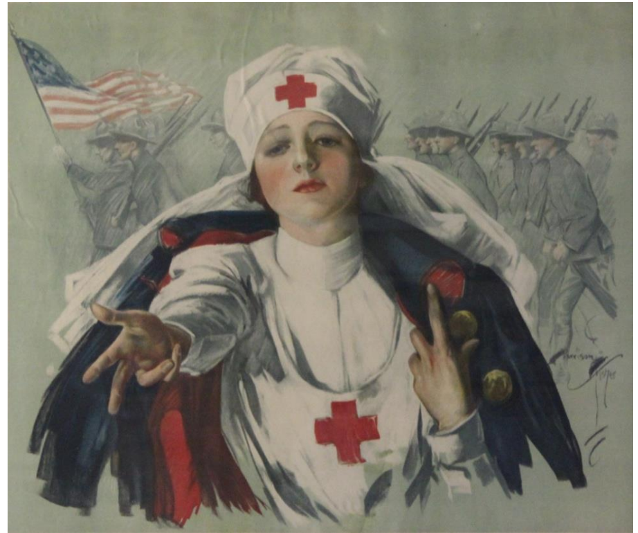
Poster from his personal collection