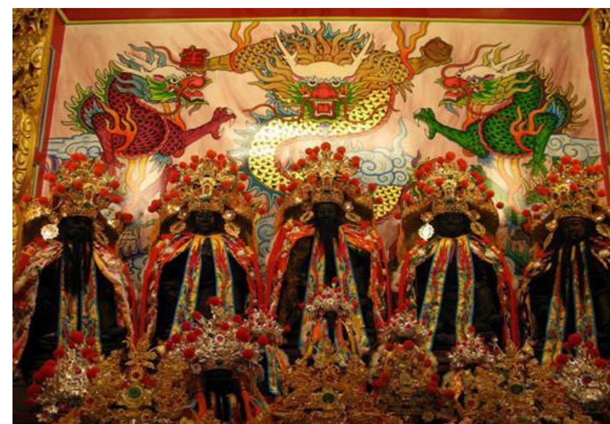
Jade Emperor and The Great Emperors of Five Blessings