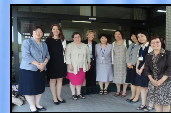
Japanese Nursing Association President & Staff