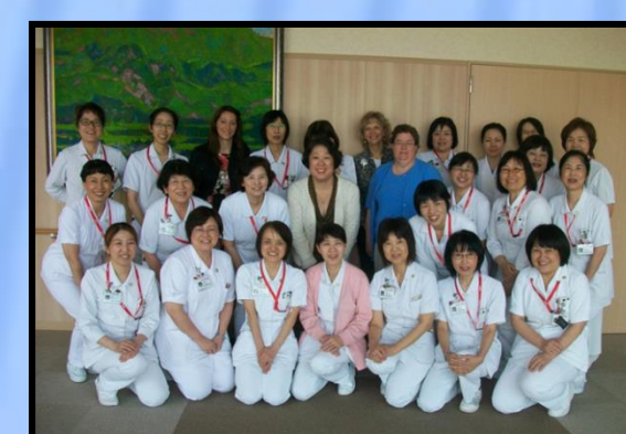
Kumamoto Red Cross International Hospital