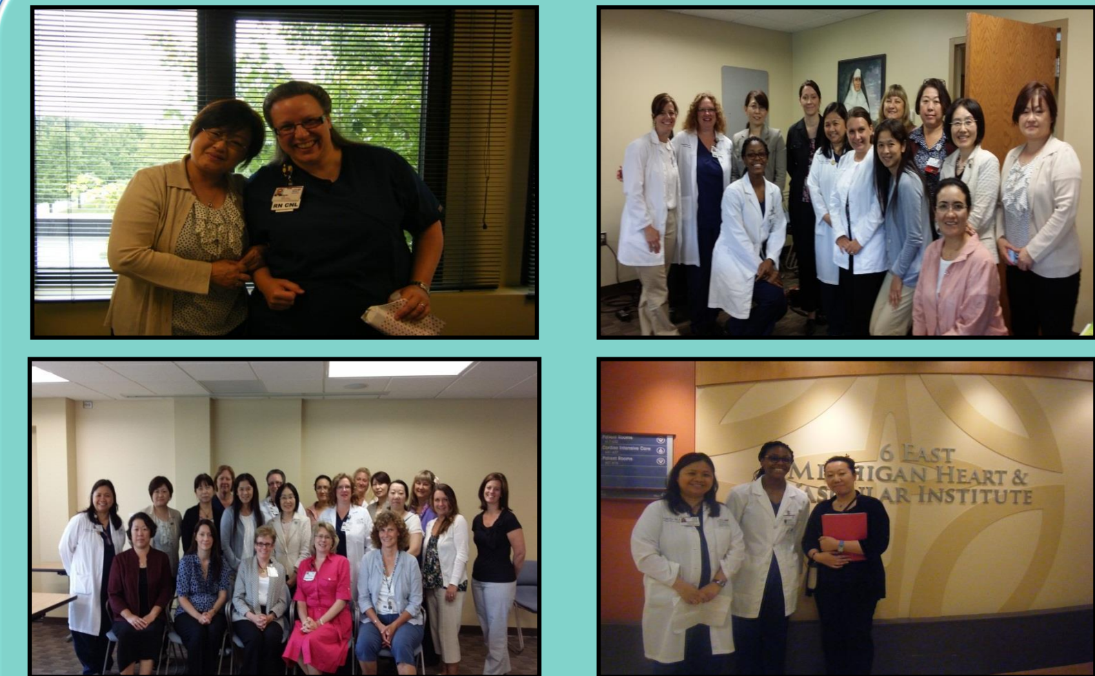
First Bilingual comprehensive CNL immersion Trinity Saint Joseph Mercy Ann Hospital in Ann Arbor Michigan