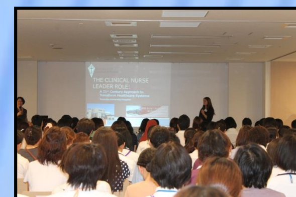
Tsukuba University Medical Center