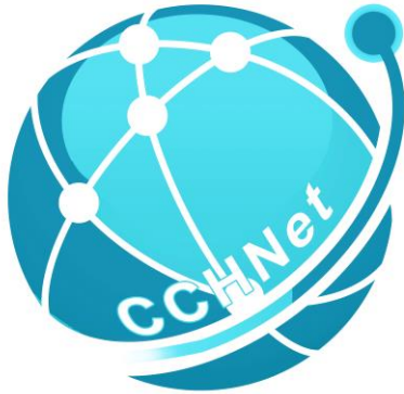
Center for Correctional Health Networks