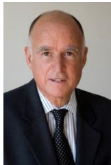
39th Governor of California