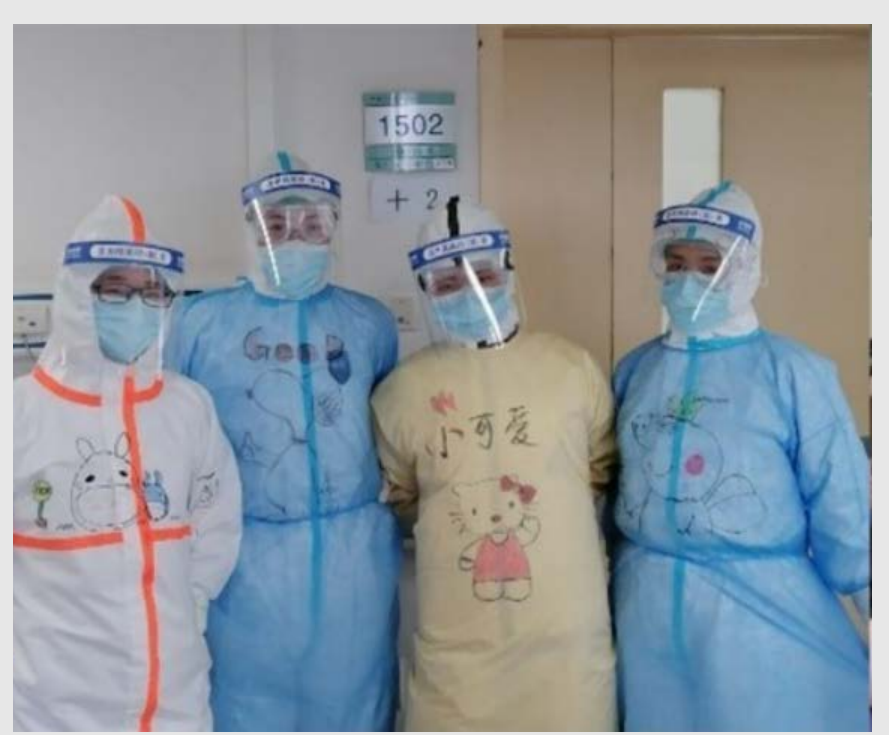
PolyU student in PPE with a Hello Kitty drawing on the gown to establish a caring atmosphere in wards.

New, interactive training systems were utilized to prevent outbreaks in residential care homes