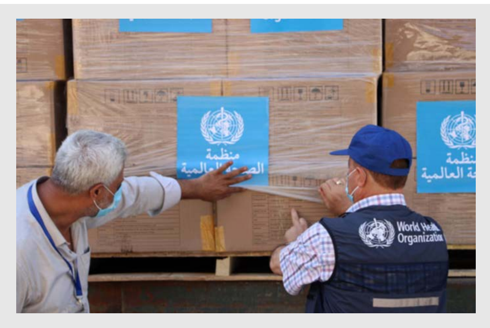
In the Gaza strip, WHO delivered 50 000 COVID-19 sample collection swabs and 1000 rapid tests to local health authorities. This delivery comes at a critical time as testing supplies are running low due to the ongoing spread of the virus.

EMRO continues to experience humanitarian crises that have led to the forced displacement of millions of people, weakening of health system structures and the increase of infectious diseases. The COVID-19 pandemic has been a further blow to many countries. In five EMRO countries, more than 25% of the population are living below the international poverty line. The density of nursing and midwifery personnel (per 10 000 population) in the region is less than the global average and the second lowest among all WHO regions emphasizing both the importance of workforce development and also the challenges of addressing complex healthcare problems.