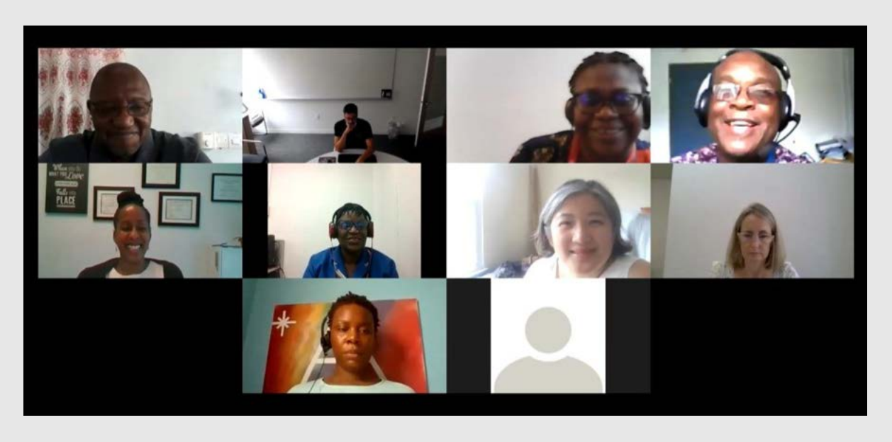
The familiar "Zoom Room" we have all come to know!