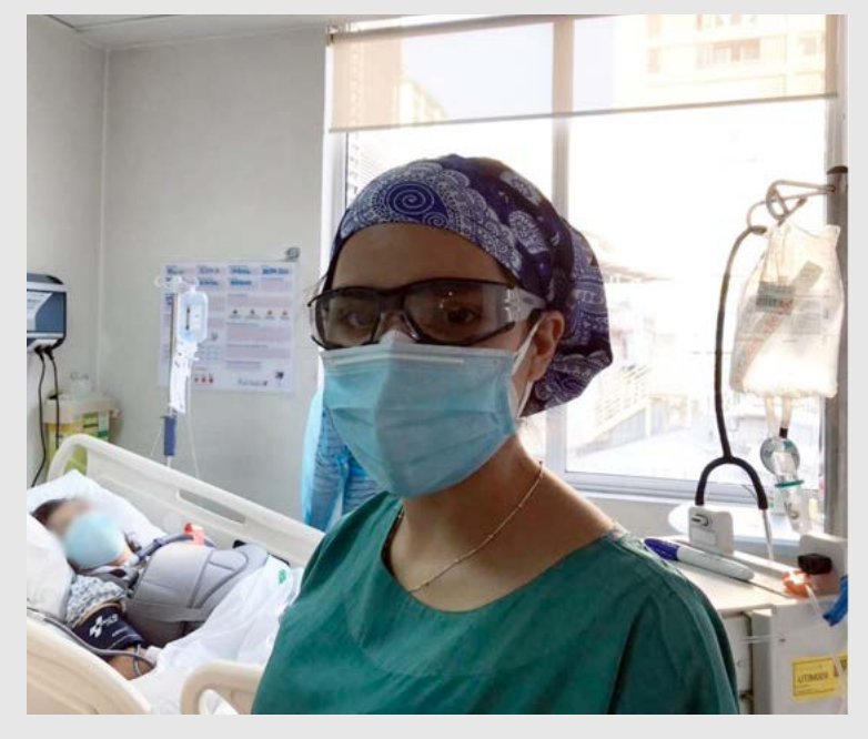
On the frontlines during the initial Covid-19 outbreak

In this context, the Ministry of Health issued a call for health professionals to meet the care demands of Chileans infected by Covid-19. The School of Nursing of the Pontificia Universidad Católica de Chile responded by creating a Certificate of Academic Specialty (CAE) in "Nursing in Health Crises" for students in the last year of their degree program. The Certificate required students to complete an average of 40 theoretical hours (taught remotely) and 580 clinical hours (in person).