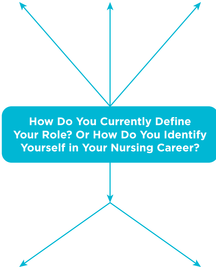
FIGURE F.1 Here, you can put particular components of the overall role you need to be focusing on.

Here, you can fill in areas that are relatable to your role, scope of work, and/or goals and criteria for evaluation. This will assist you in highlighting what areas you are working on and accomplishments to be discussed.