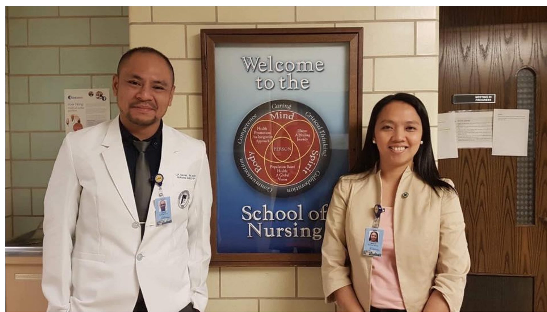
Visit to The College of Saint Scholastica Duluth, Minnesota (Fall, 2018)