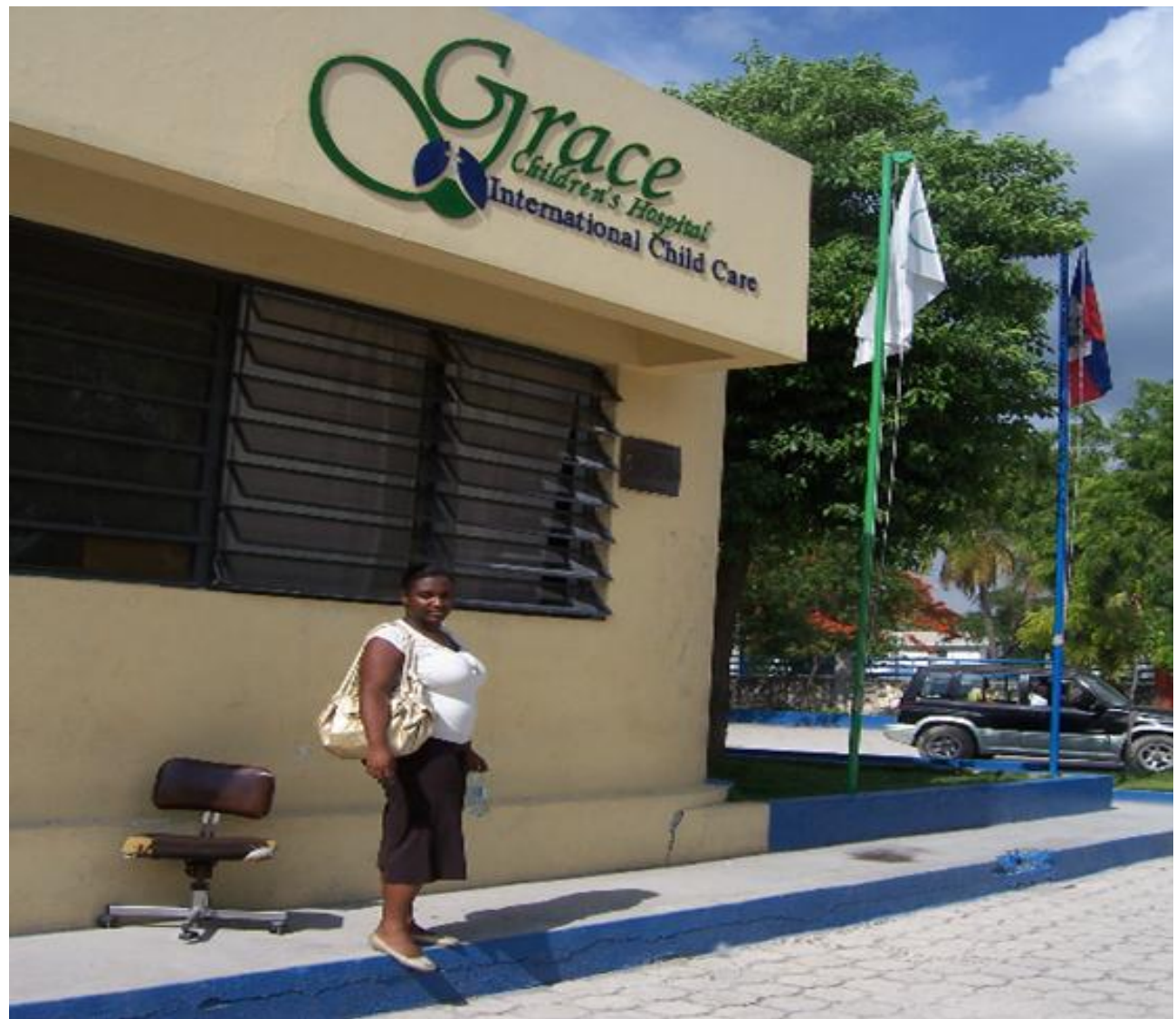
Grace Children's Hospital in Port au Prince, Haiti One of our surveyors