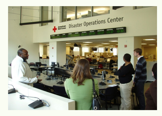
Disaster Operation Center - American Red Cross, National Headquarters, Washington, D.C.