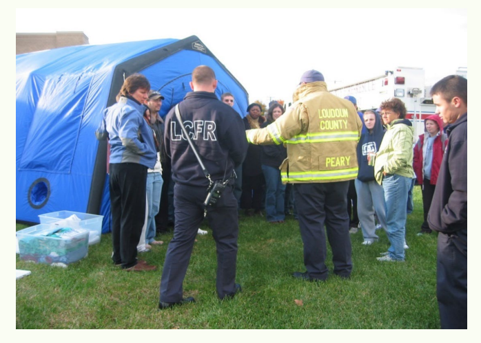
Community Decontamination Exercise