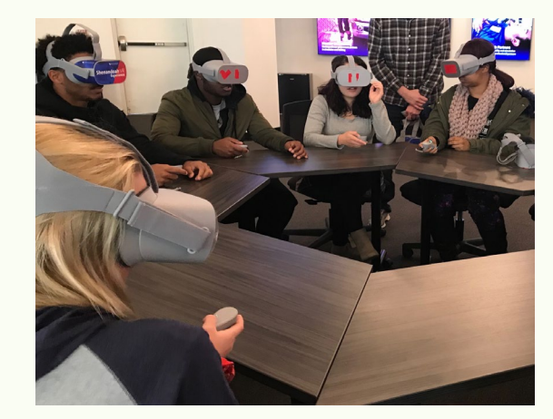
360 Virtual Reality