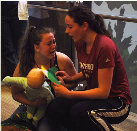
Interprofessional Disaster Simulation