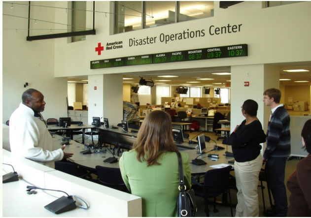
Disaster Operation Center - American Red Cross, National Headquarters, Washington, D.C.