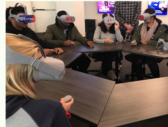
360 Virtual Reality