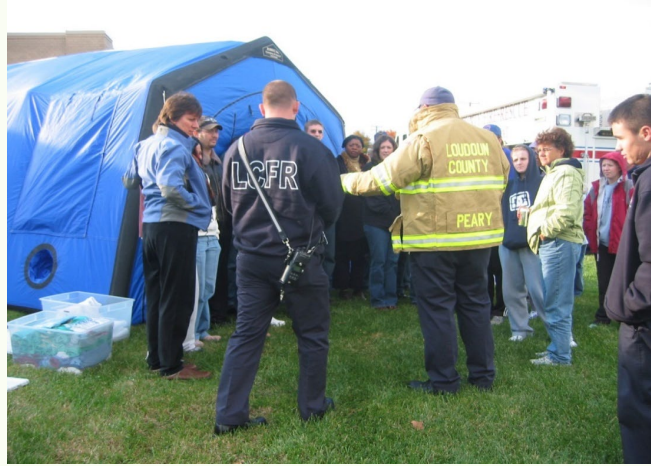
Community Decontamination Exercise