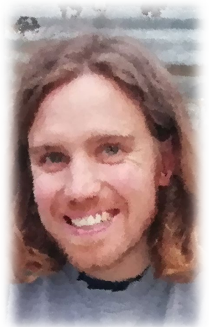
Personal photo of JWN

I'm doing what is expected I'm doing what you can see, what can be recorded I given you your towels You can shower yourself – what's a drain tube or two Don't bother me and ask for anything. I'm on automatic, rush, rush, rush there's so much to do Bed # 22 is just so difficult You want a shower now – but it's only 5.00am! Your dentures cleaned, a shave Didn't you know 3-day growth is the fashion.