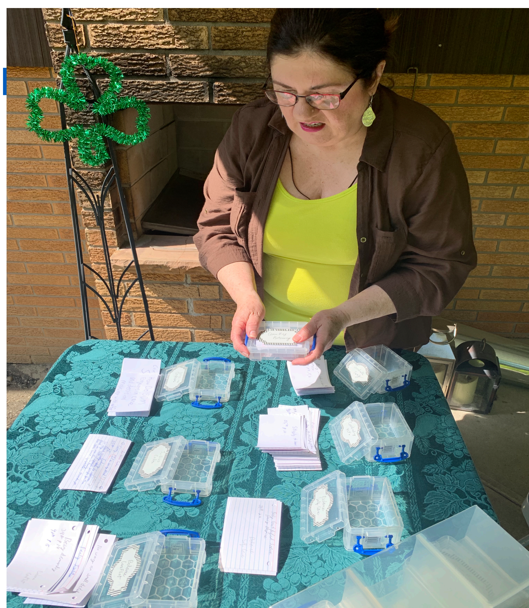
Categorizing abstract concepts from constant comparison of coded data