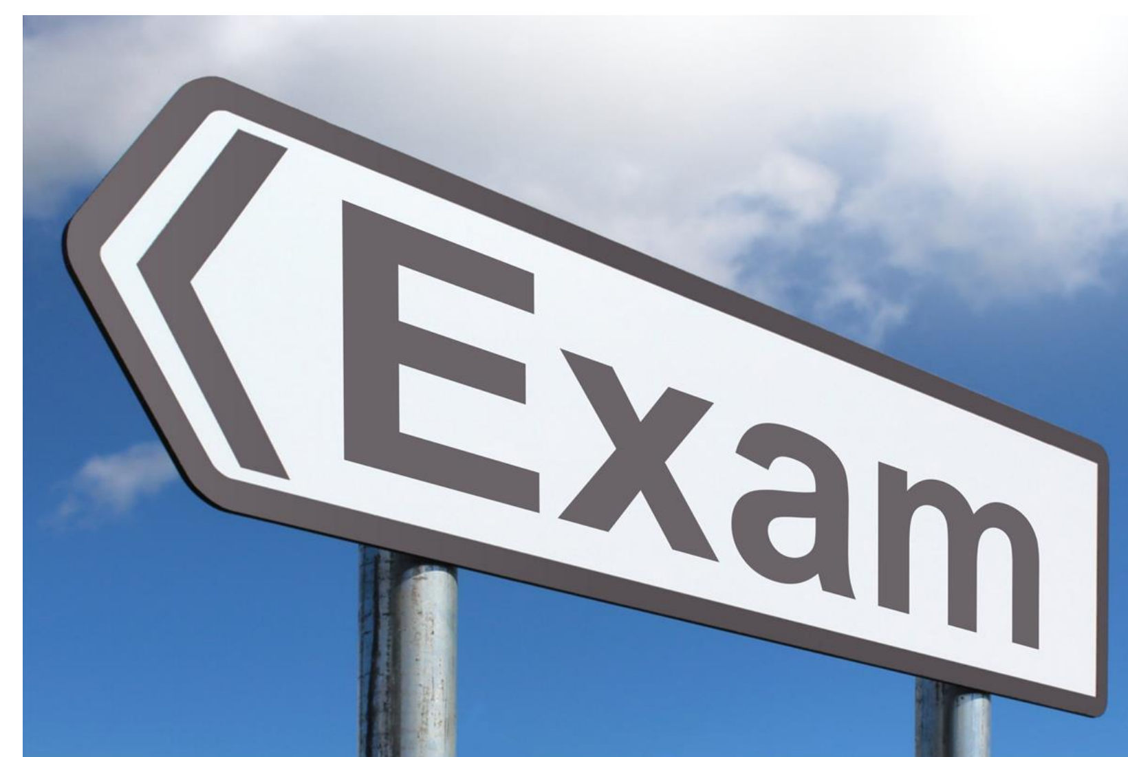
Figure 1. Youngson, N. (2014). Exam [Online image]. Retrieved from http://www.picpedia.org/highway-signs/e/exam.html