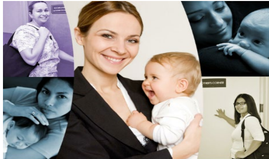
Working and Breastfeeding It Can Work!