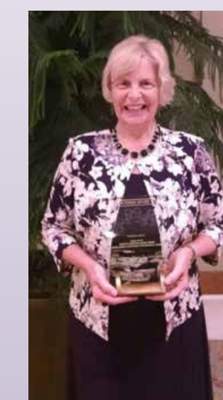
Dorothy Garrigus Adams Founders Award