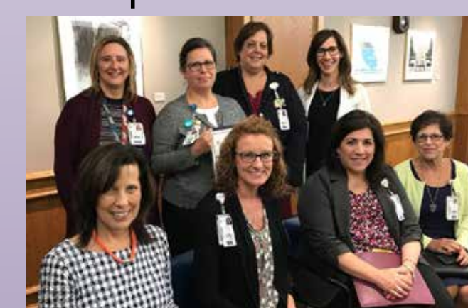
Nurses Week Practice Awards to nurses at area hospitals