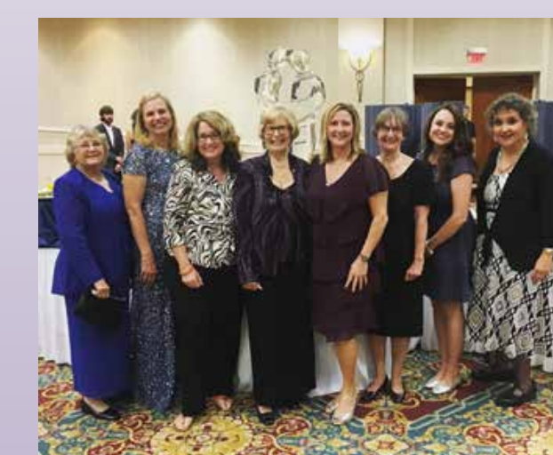
Cameos of Caring