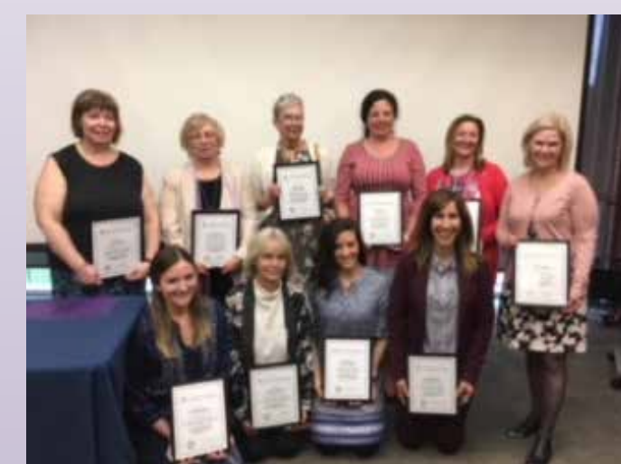
Excellence Awards recipients